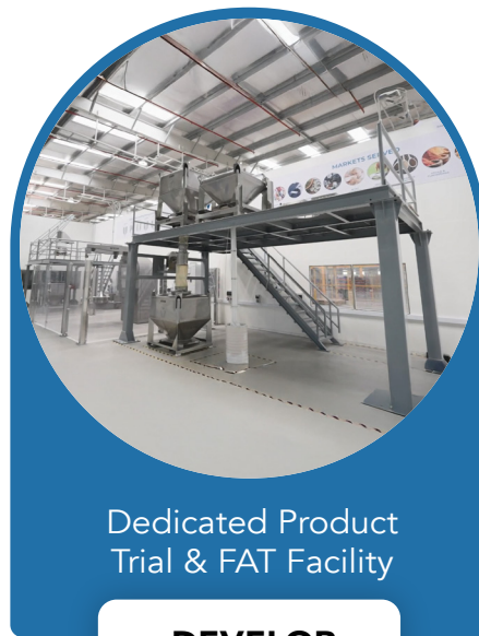
Dedicated Product Trial & FAT Facility