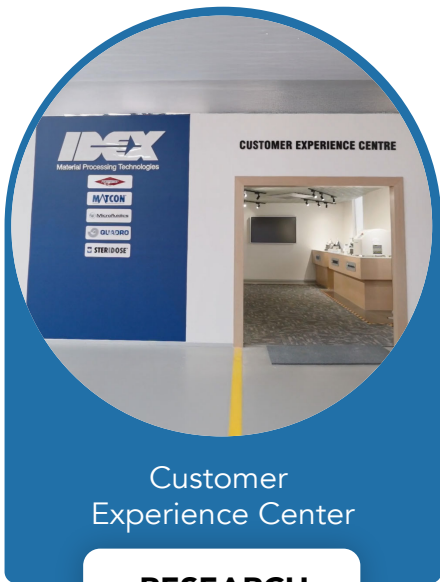
Customer Experience Center