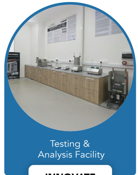
Testing & Analysis Facility